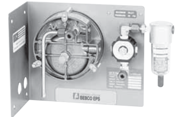
Model ILFK-4 SHOWN IN "OUTBOARD" POSITION