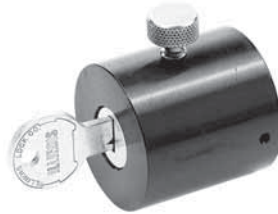
Model L Key Lock Assembly