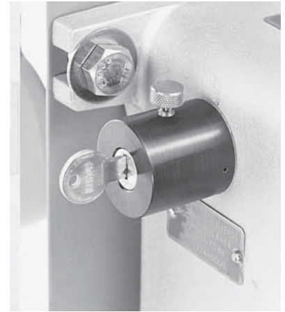
Typical Model L Installation